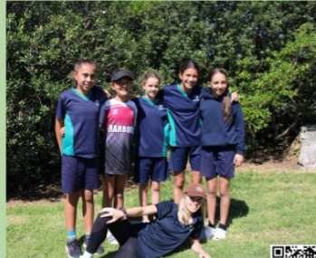
Scan the QR code to see other photos/ of the day